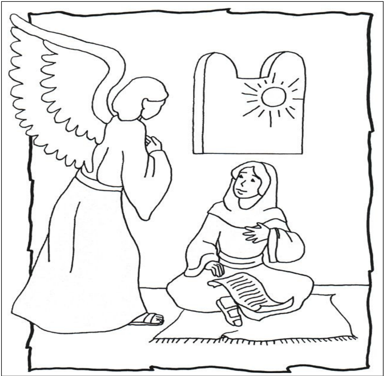
For the children to colour in The Angel comes to Mary